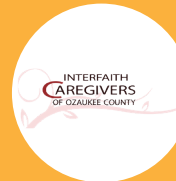
Transportation and Mobility Program