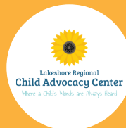
Trauma-Informed Care for Children and Families